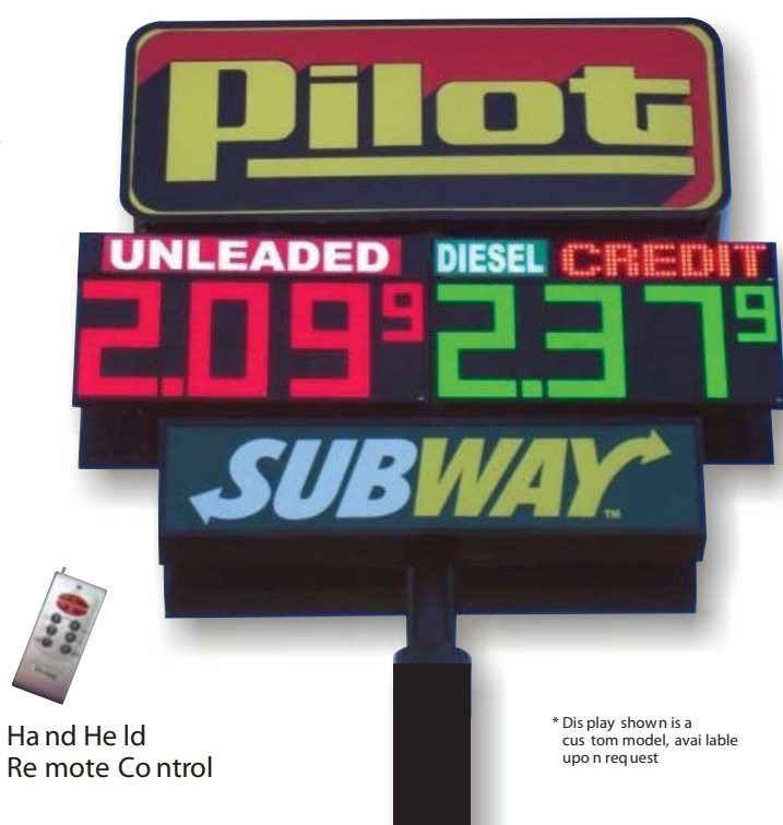
Hand Held Remote Control